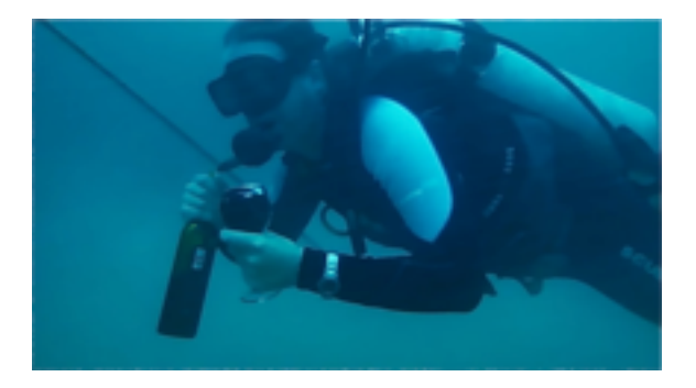
VIDEO: Sub-aquatic wine tasting (3:34)

Here are some examples of web video content: