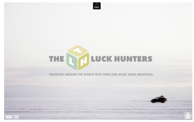
The Luck Hunters Sizzle Reel (pword=tlhsizzle)

"Welcome to The Luck Hunters! Two friends, five continents, 24 time zones, 47,000Km, a bottle of wine, and a guitar..."